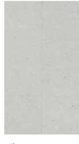
Vibrant Stone Powder 60001902