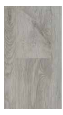
Nostalgic Oak Ash 60001901