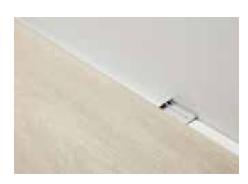
end profile SILVER / BRONZE / CHAMPAGNE 63000579 / 63000581 / 63000580

paintable modern skirting 100 mm 9372-3045