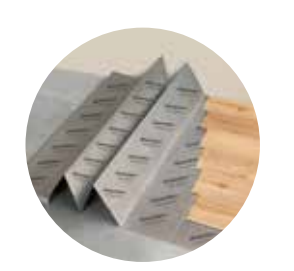
Dreamtec+ 10 m<sup>2</sup> - 1,5 mm

Your Live floor is going to be awesome, but you can make it even better with our various accessories. Our Dreamtec+ and Basetec underlays reduce noise and will flatten out minor defects in your subfloor. Round out your floor with a choice of paintable skirtings – go for that lemon yellow wall you've always dreamed of! Finally, create a smooth transition between other floors with the right profiles for that finishing touch.