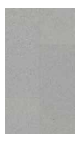
Vibrant Stone Oyster 60001904