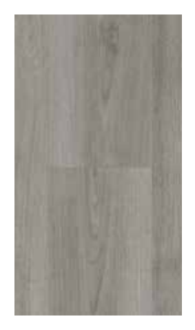
Serene Oak Smoke 60001894