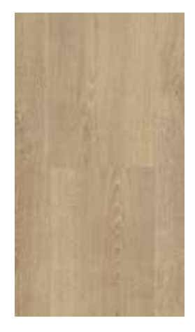
Serene Oak Gold 60001892