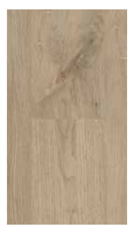
Nostalgic Oak Latte 60001898