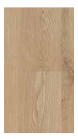
Nostalgic Oak Honey 60001897