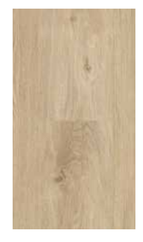
Nostalgic Oak Sand 60001896