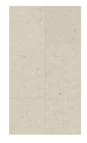
Vibrant Stone Dune 60001903