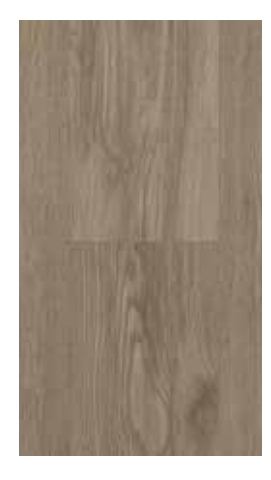
Nostalgic Oak Mocha 60001899