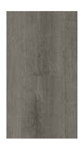
Serene Oak Coffee 60001893