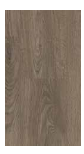
Nostalgic Oak Cinnamon 60001900