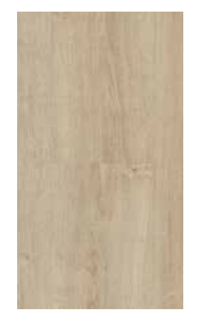
Serene Oak Blonde 60001891