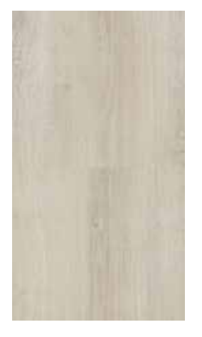
Serene Oak Cream 60001890