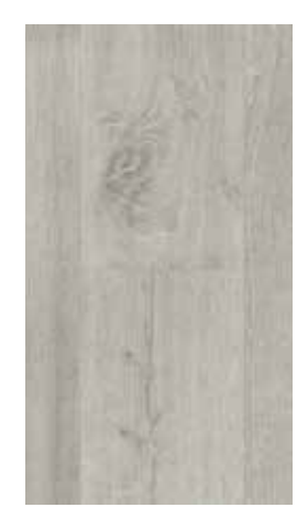
Serene Oak Pearl 60001895