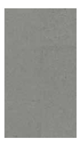
Vibrant Stone Gunmetal 60001905